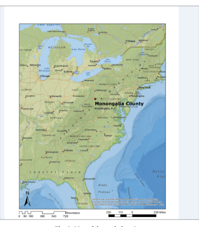
Fig. 1. Map of the study location.

An online survey was conducted during the winter season of 2015–2016, targeting residents who lived in Morgantown and its surrounding areas within Monongalia County. Morgantown can be considered as a semi-urban city within one of the most rural states in the U.S. Surveys were distributed online using 5492 residents' email addresses. A database containing those was purchased from a commercial company. The sample was randomly selected from Monongalia County residents who had an email address. A total of 557 respondents answered the online questionnaire. Due to the impossibility to match P.O. box addresses with real residential addresses, the answers of 22 respondents had to be dropped for proximity analyses. As such, a total of 535 responses were used for the following analyses After matching responses to residential addresses, the data indicated that a total of 90% of the respondents lived in the vicinity of Morgantown (see Fig. 2). Non-response bias check was conducted using early and late respondents